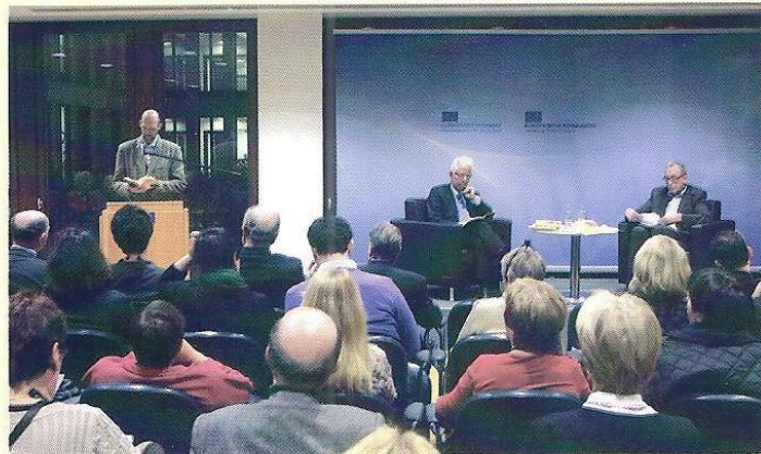
View of the event

language from the whole range of his work; the poems were previously performed in German by a German actor.